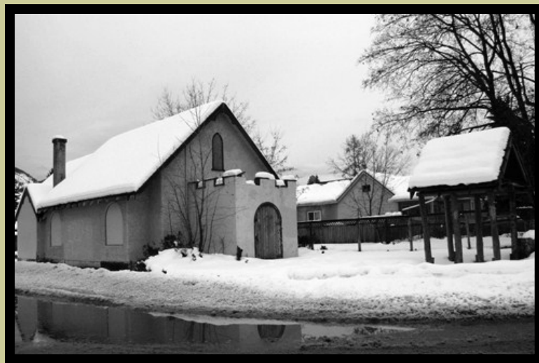
St. Aidan's Church, Rutland Road, Kelowna. See article on page 6.

Top: Opening on June 15, 1933