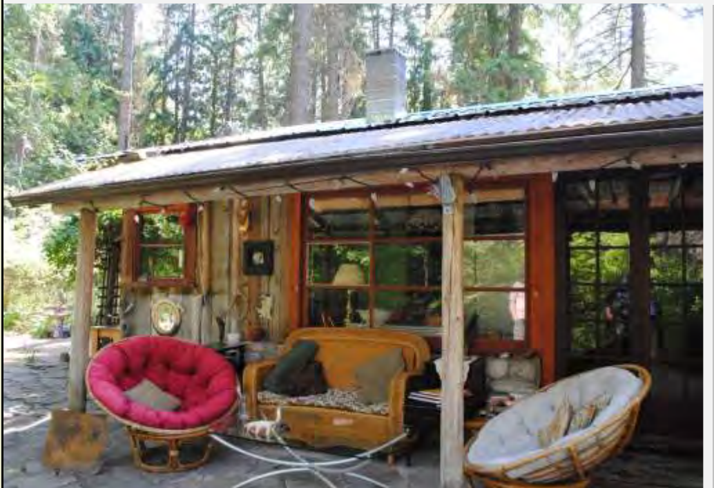
The Raymer Cabin located in Woodhaven Nature Conservancy Regional Park