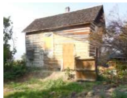
First Mallam House addition