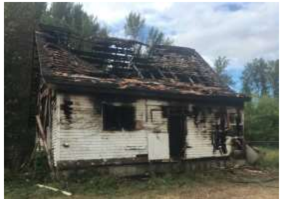
The Fleming House today, 2018

The Heritage Homestead and Grist Mill site have been the subject of 4 feasibility plans, done in 2001, 2008, 2011 and 2014. Community meetings, studies and discussions have gone on for many years. The latest proposal done in 2014 by COHS was presented to the City of Kelowna with a three phase project totalling a projected cost of $100,000. The proposal would have seen the site looking dramatically different than it does today. It was hoped a grand opening of the park would be ready for Canada's 150th birthday in 2017. With the new Rail/Trail cycling path running adjacent to the property, the time is now to put our community resources and tax dollars to work to bring this park to life!