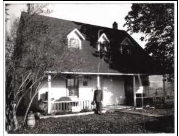
Fleming House, c.1960s; KPA #5397