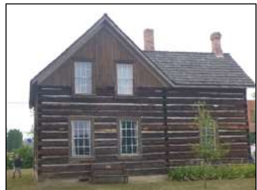
Christien House at Father Pandosy Mission