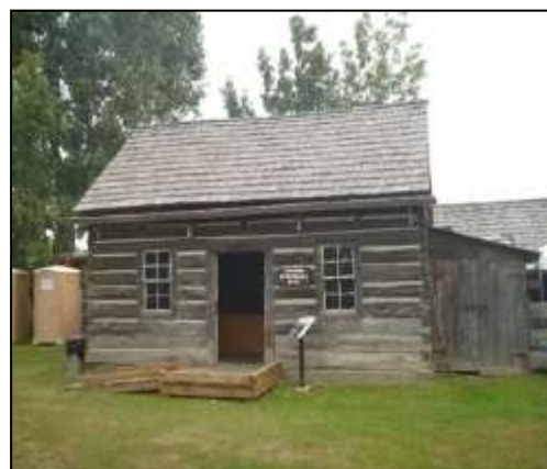
Second McDougall House, now at Pandosy Mission