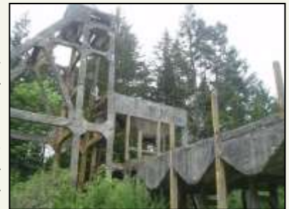
Morden Colliery

Morden Colliery, built in 1913, comprises the physical remains of a Vancouver Island coal mine, including the mine pithead, a reinforced concrete headframe and tibble, and the remains of related buildings and structures dispersed throughout a 4-hectare wooded site.