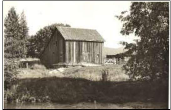
The Grist Mill

Built in 1871, Brent's Grist Mill was the first industrial enterprise in the Okanagan Valley and is the oldest surviving grist mill building in British Columbia. For this reason the mill has both local and provincial significance. A stabilization project was undertaken on the mill building in 2016 by a team including a heritage consultant (conservation plan), heritage contractor and an engineer.