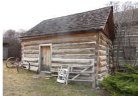
First Mallam House (original cabin)

It is very unfortunate what happened, and my family is heart sick to lose this historical building but I don't see how it could have been avoided.